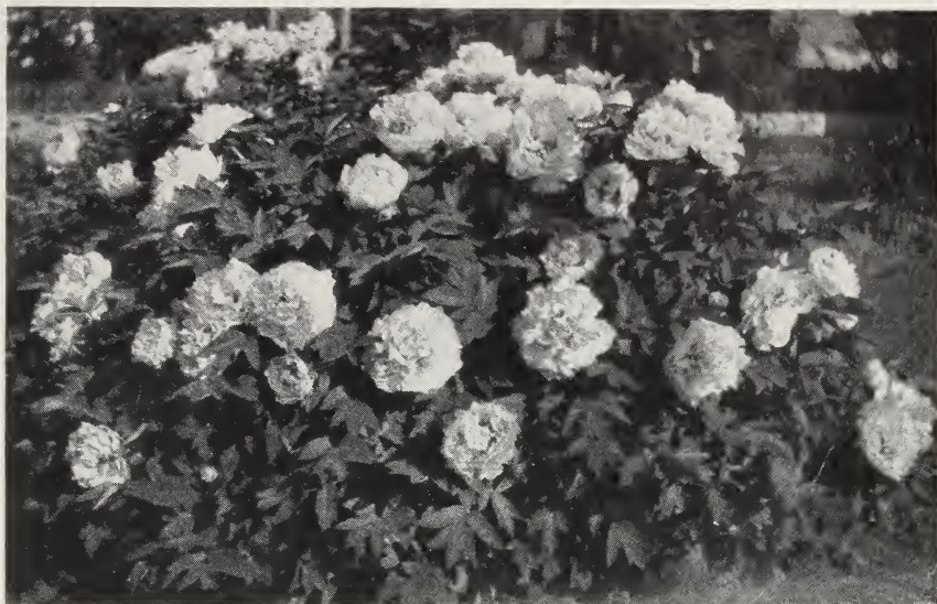
PÆONIA ARBOREA (Tree Peony) BANKSI, 10 years old, on its own roots, 4 feet high, 15 feet in circumference, bore 125 double, flesh-pink flowers in 1929.—Oberlin Peony Gardens, Sinking Spring, Pa.